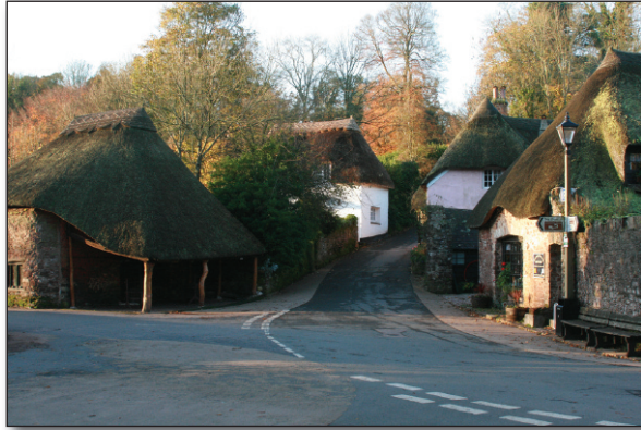
The famous Cockington Forge, near Torquay