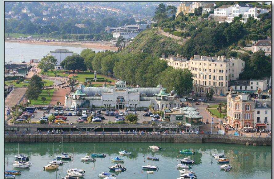
The Torquay Pavilion from Vane Hill