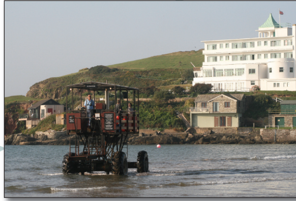
The sea tractor, Burgh Island