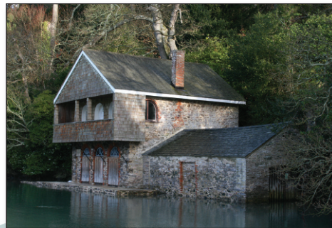
The Boathouse below Greenway, at high tide