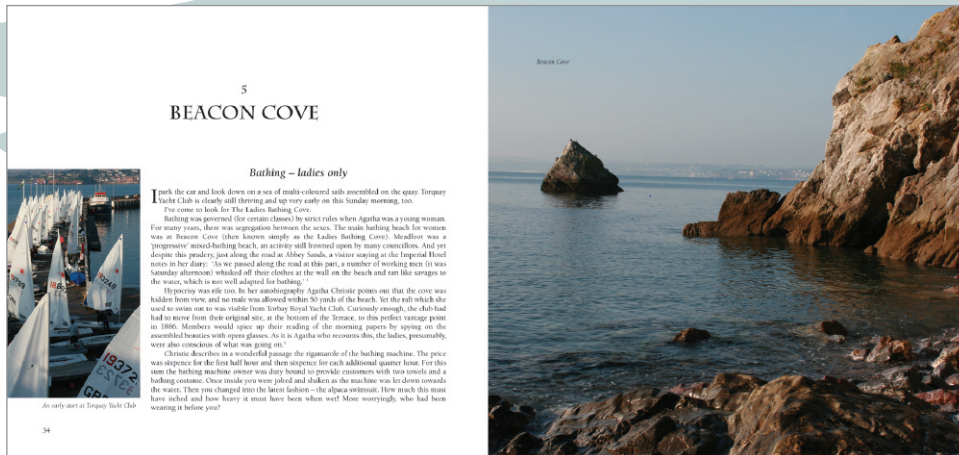
Left: Example of a double-page spread