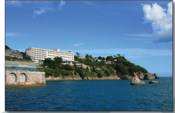
The Imperial Hotel's impressive location